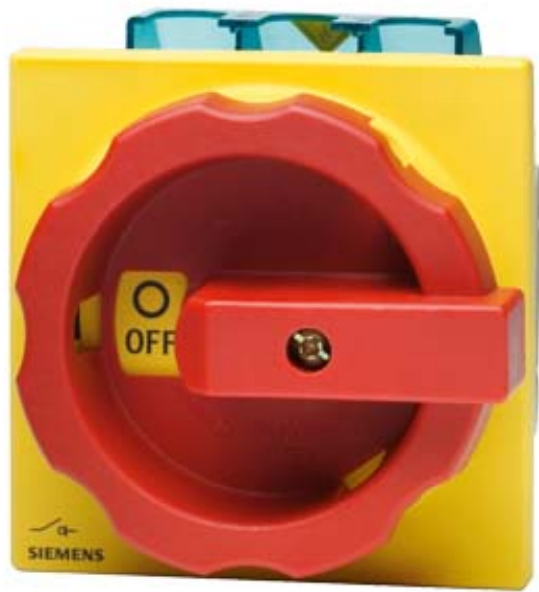
EMERG. STOP SWITCH 3-POLE IU=16, P/AC-23A AT 400V=7.5KW FRONT MOUNTING FOUR- HOLE MOUNTING ROTARY ACTUATOR RED/YELLOW (EMERG. STOP)