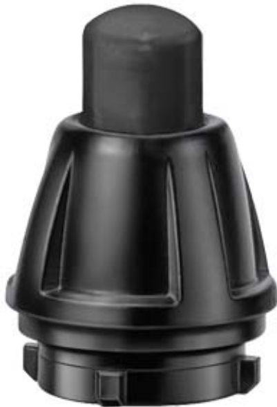
ACTUATOR HEAD, PLASTIC, FOR POSITION SWITCH 3SES5132 ROUNDED PLUNGER, FORM B, PLASTIC, TO EN50041