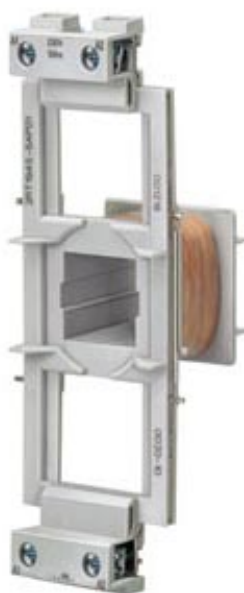
COIL FOR CONTACTORS SIRIUS, SIZE S3, SCREW CONNECTION, AC 110 V, 50 HZ