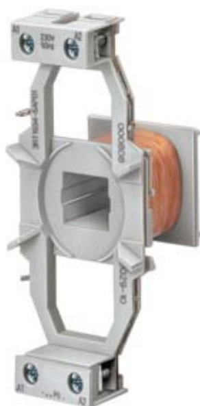
COIL FOR CONTACTORS SIRIUS, SIZE S2, SCREW CONNECTION DC 24 V