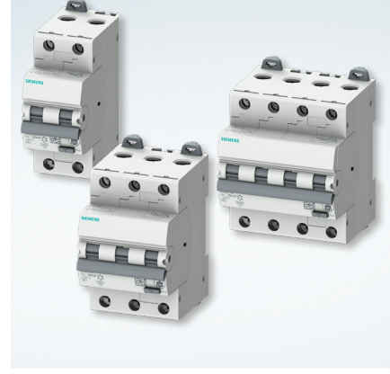
5SU1 RCBO as 2-, 3- and 4-pole version