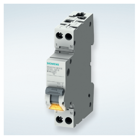
5SV6 AFDDs with integrated MCB in only 1 MW

The new 5SV1 is the first electromechanic (voltage independent) RCBO on the IEC market in only one modular width. In combination with the 5SM6 AFD unit, preventive fire protection is thus possible in a total of only 2 modular widths.