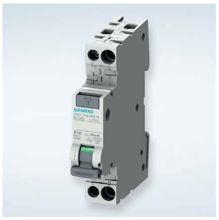
5SV1 RCBO with voltage independent RCD function in only 1 MW