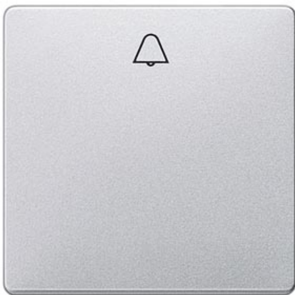
I-SYSTEM, ALUMIN.METALLIC ROCKER W. BELL SYMBOL FOR PUSHB., 55X55MM