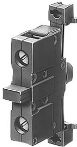
COMPONENT FOR ENCLOSURE, 22MM CONTACT BLOCK WITH 1 CONTACT ELEMENT SCREW TERMINAL, 1NC